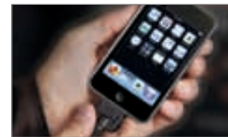
Auxiliary audio input