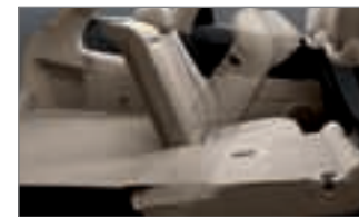
60/40-split fold-down rear seatback