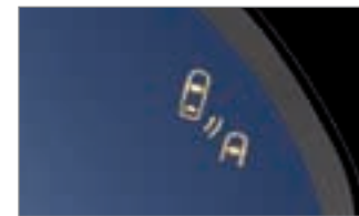
Blind-Spot Monitoring System (BSM)