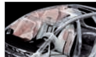
Advanced Dual Front Air Bags