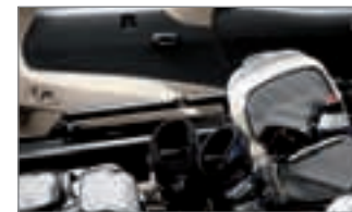
Virtually flat load floor