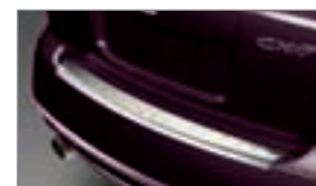
Rear bumper step plate - Stainless steel