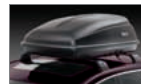
Cargo box - Short