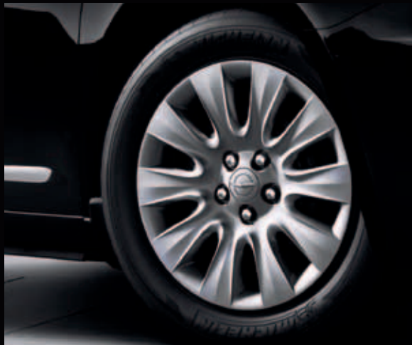
17-INCH WHEEL COVER Standard on LX