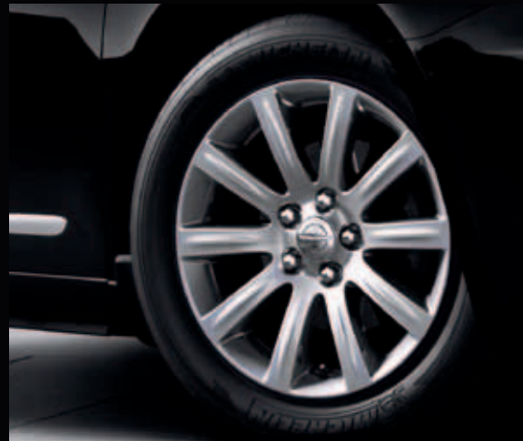
17-INCH ALUMINUM WHEEL Standard on Touring Available on LX