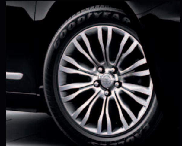
18-INCH POLISHED ALUMINUM WHEEL Standard on Limited Available on Touring